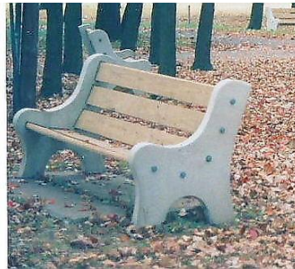
6' park bench - $425.00

When you order a commemorative bench you will discuss its location within the Lower Providence Township Parks System with the Parks & Recreation Director. Lower Providence Township must approve the wording and size on any plaques you wish to include on the bench.