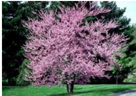
Eastern Redbud - $200.00