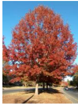
Red Oak - $250.00