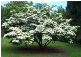
Dogwood - $200.00

As trees are fragile, living things, they are planted in the spring or fall when conditions are the best.