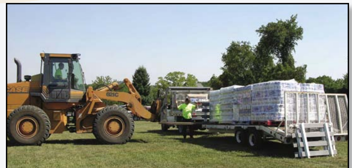
Public Works personnel help to move items donated to the hurricane relief effort.

The Public Works Department remains dedicated to providing the Lower Providence community with exceptional service and maintaining safe roads for the motoring public. Residents are invited to visit the Public Works page at the Lower Providence Township website ( www.lowerprovidence.org ) for snow removal information, road opening fee structure and permits, and useful links.