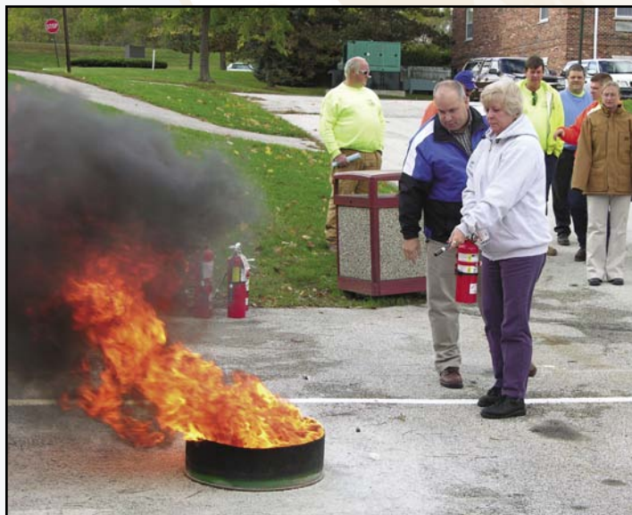
A member of the Code Enforcement staff participates in a hands-on fire extinguisher training session conducted by the township's Safety Committee.