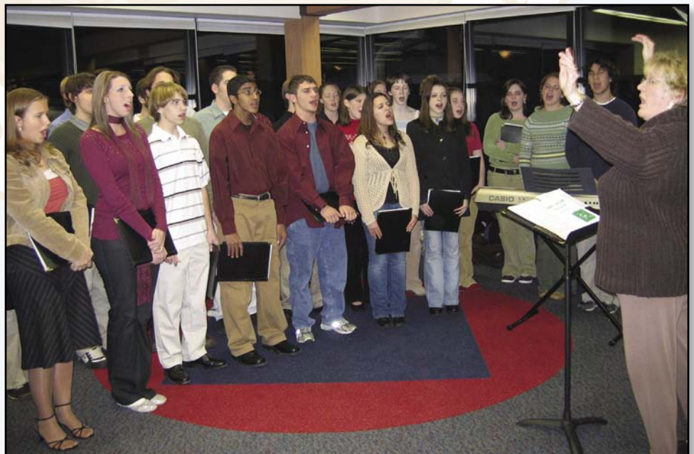
The Friends of the Library hosted a concert featuring the talented Methacton Chorale.

Over 500 elementary and 140 preschool age children par-