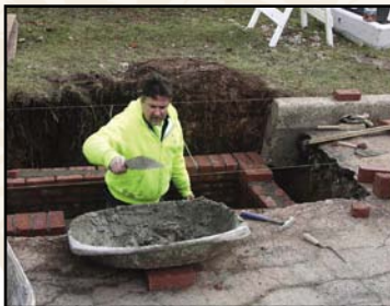
As part of its highway maintenance duties, the Public Works Department repairs and replaces storm water inlets throughout the township.

In preparation for the annual Road Reconstruction bids, the director completed a review of the work required for the projects, which included estimating quantities and preparing the bid package. A total of 2.14 miles of roadway were paved in 2005; the work took place on Mockingbird Road, Whipoorwill Road, Parklane Drive, Township Line Road, East Mount Kirk Avenue, and Grandview Road.