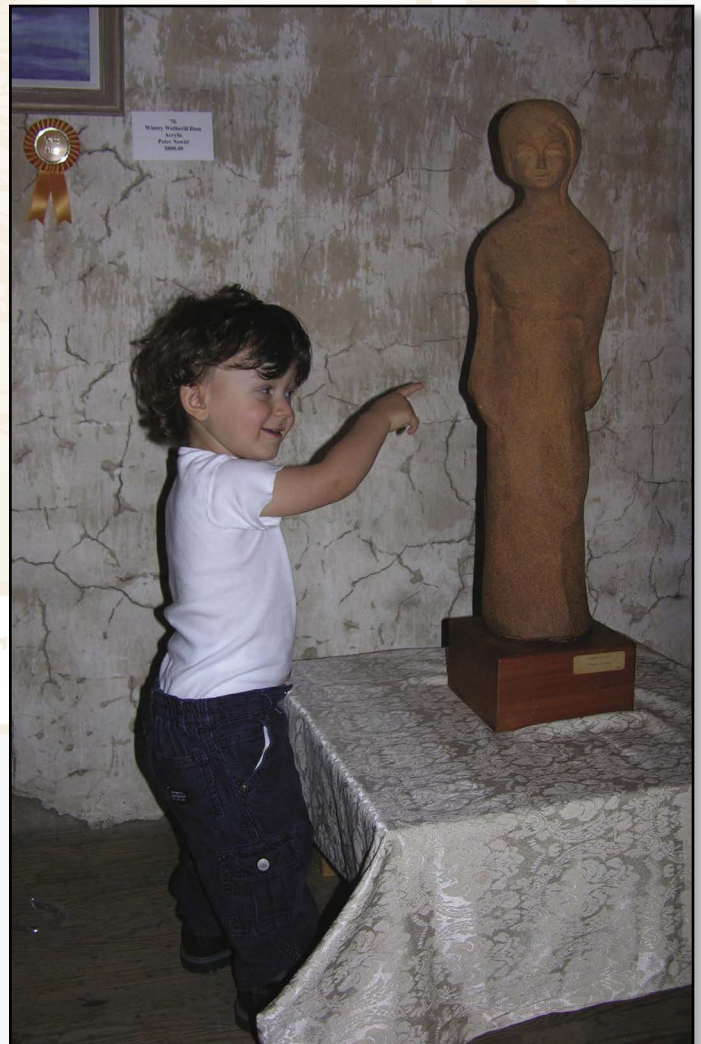
A young visitor admires a sculpture at the township's first-ever Art Show and Exhibit.