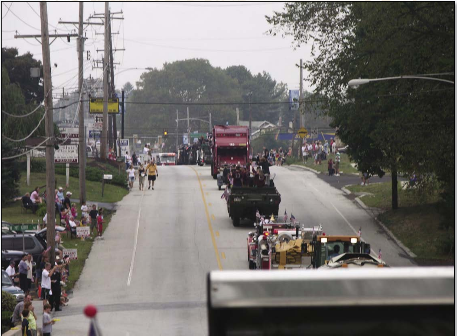
A bird's-eye-view of the Bicentennial parade route from aboard one of the entries.

To request a brochure, call the Township Administration Office at 610-539-8020, or visit the township website at www.lowerprovidence.org/parks_recreation .