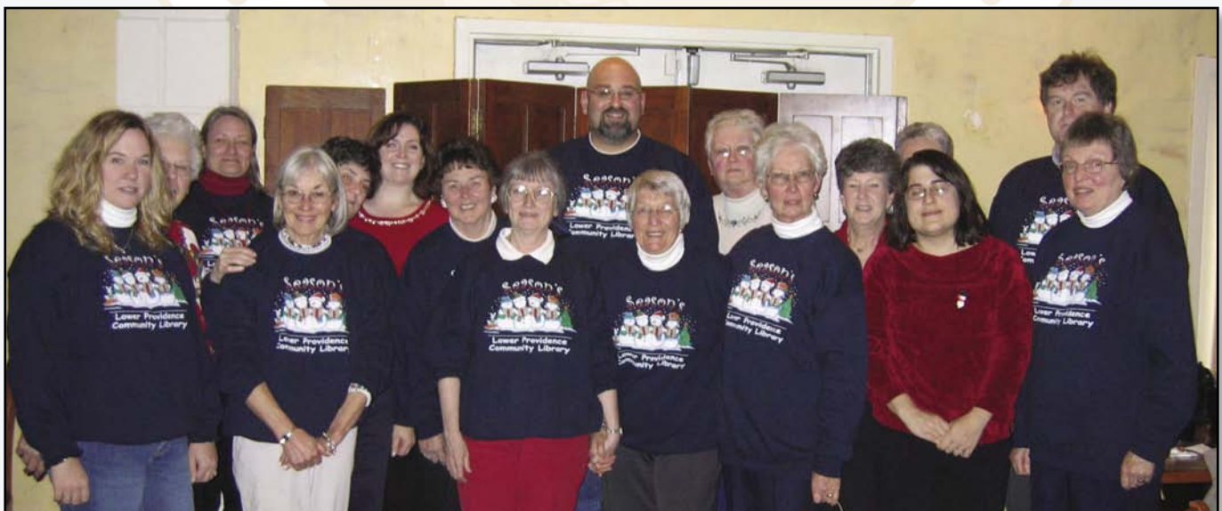
Members of the library staff gather for a photograph at the annual holiday get-together.

The Library staff, Friends and Trustees look forward to continuing to provide a high level of library service to the Lower Providence community in 2006. We welcome and encourage your involvement with your local library!