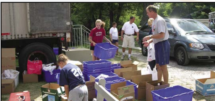
Donations for victims of Hurricane Katrina were collected through "Operation Good Neighbor," one of the many special projects in 2005.

The township's Community Access Channel, a joint venture of the Special Projects and Technology Department and the Methacton School District, made its debut on March 1. The channel marks another step forward in the township's commitment to providing residents the best technology has to offer. Airing on Comcast Cable Channel 3, the channel is up and running 24 hours a day, 7 days a week, providing a continuous listing of community events, school announcements and township information. Equipment is maintained at the Methacton High School, under the Technology Services Group, and department is working closely with school district officials to ensure the success of the channel. The Community