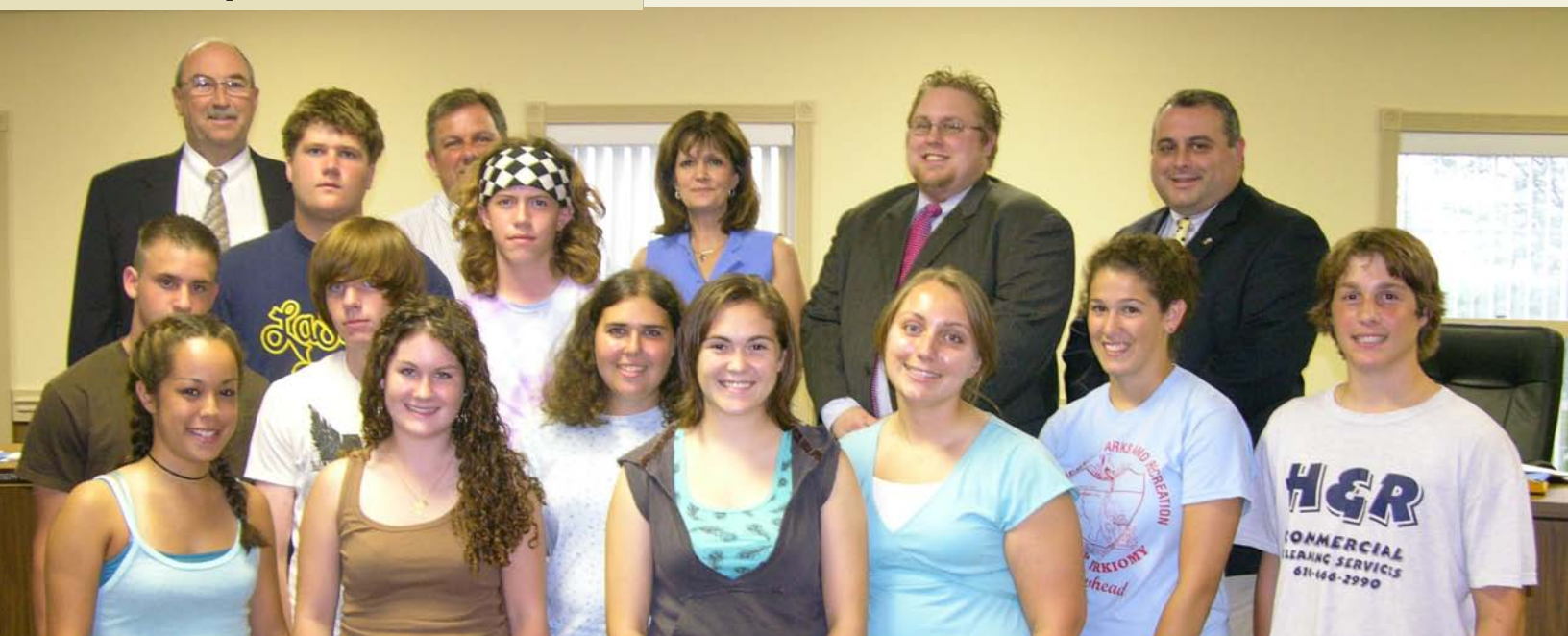
▼ Outstanding Youth Award recipients and the Board of Supervisors

Counselors not needed for their regular duties offered to help the Township in whatever way they could. They handed out flyers, served as runners for the Emergency Operations Center, and helped to distribute dry ice. These exceptional teens were presented with Outstanding Youth Awards by the Board of Supervisors.